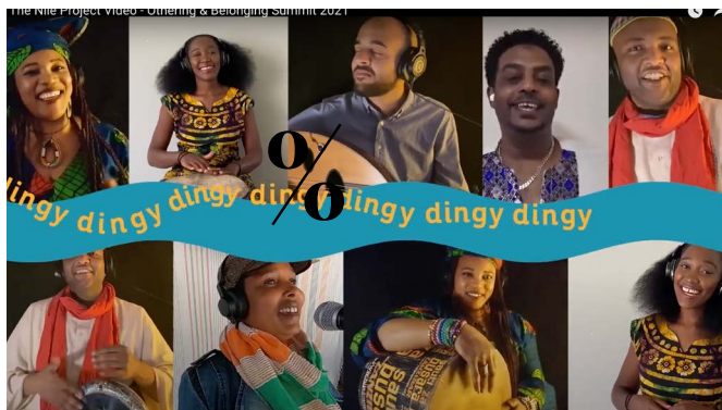
African collective “The Nile Project” recorded a commissioned video premiered during our 2021 April Summit, followed by an artists’ talk back

People from 49 countries attended our first O&B virtual Summit. 2021